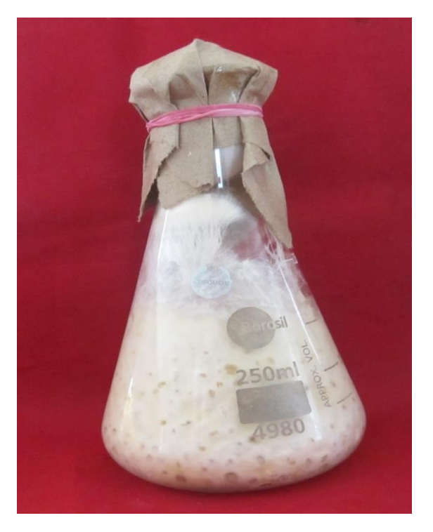
Plate-1 Mass cultured Sclerotium rolfsii on sterilized sorghum grains

Twenty-day old sorghum grain culture of S. rolfsii was inoculated @6 g/pot of the 6 kg soil pot in the top two inches soil and watered sufficiently.